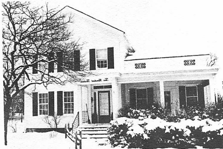
Phelps-Durand House, 213 Church St., Romeo