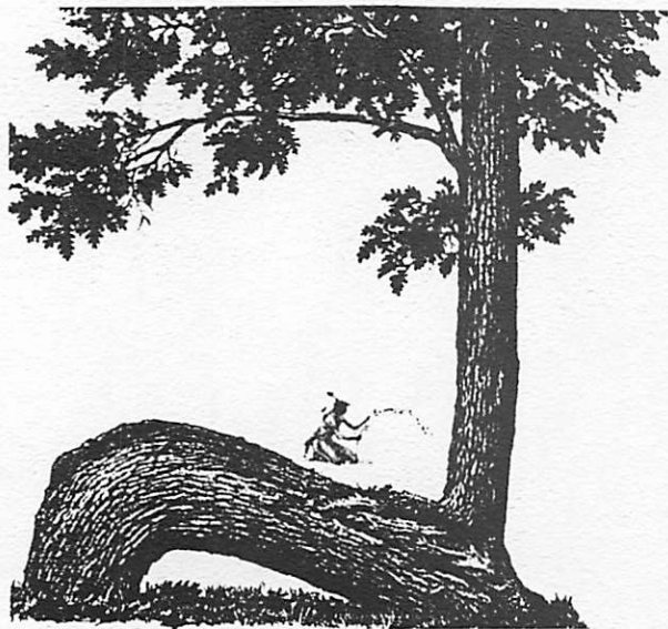
INDIAN TRAIL TREE — To mark a trail for hunting or trading, Indians sometimes bent young trees over and tied their tips to the ground. Frequently, these trees took root a second time.

Fortunately, today the Indians have become aware of their wonderful heritage. Their young people are regaining knowledge of the ways and skills of their early ancestors.