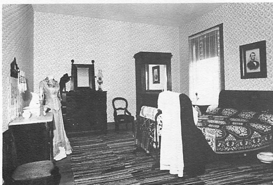
Front bedroom restored under restoration and house committee

It is the hope of the grounds committee that replanting of pines will once again make the name "Pine Grove" appropriate, but the preservation of the original trees is a primary consideration. For their assistance the Society salutes Arthur S. Griswold and Bessie Moody Griswold.