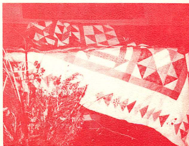
The beautiful red and white friendship quilt, product of two craft classes.