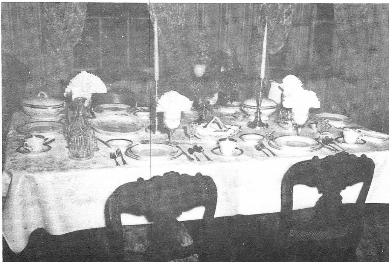
Table set for Victorian Christmas Dinner with Governor Wisner's china.

Everybody needs stocking stuffers. The Shoppe has many holiday items to sell. These include mittens, reproductions of little Christmas books, note paper—even Indian peace pipes. China head doll kits, jars of herbs, and above all—two different styles of calendar towels are offered for sale from the shelves of our ever popular store.