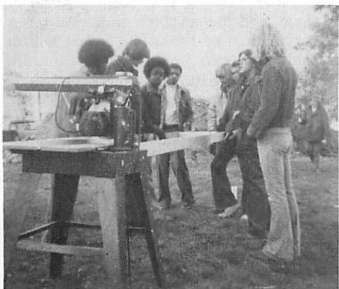
NEOVEC students- working and learning.