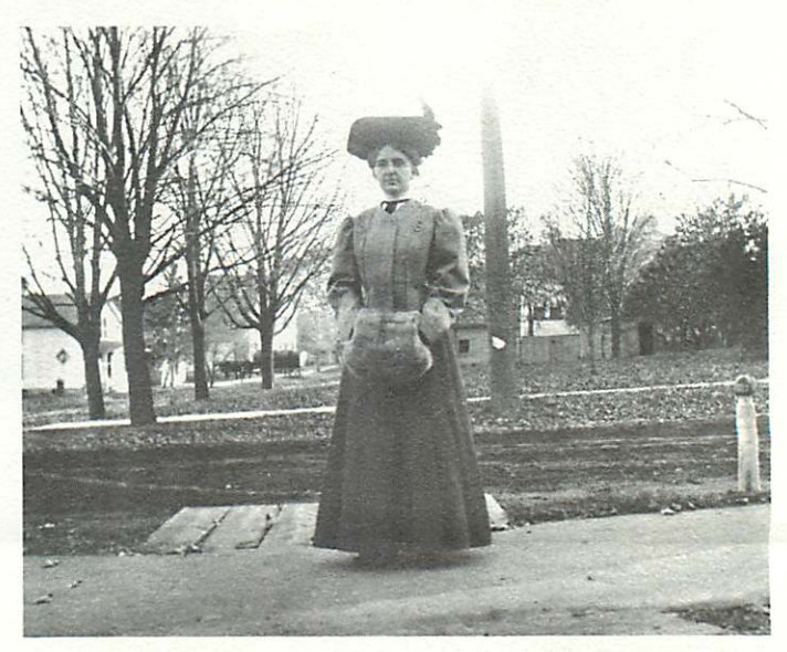
West Pike Street

The office will be trying to reach the guides regarding tours for the week of December 5th. If you have not been contacted, please call us. Tour reservations have been coming in steadily and we will need to utilize all our guides. We also have some early evening tours.