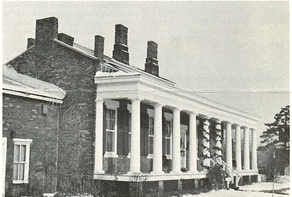
Open House at Pine Grove

Join us for the hanging of the Greens! It's a day for work, fellowship and fun. Help us get ready for our last big event of the year.