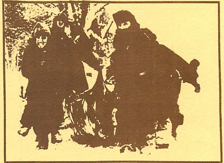
Portaging 5,000 pounds of equipment from Niles, Michigan to South Bend, Indiana.