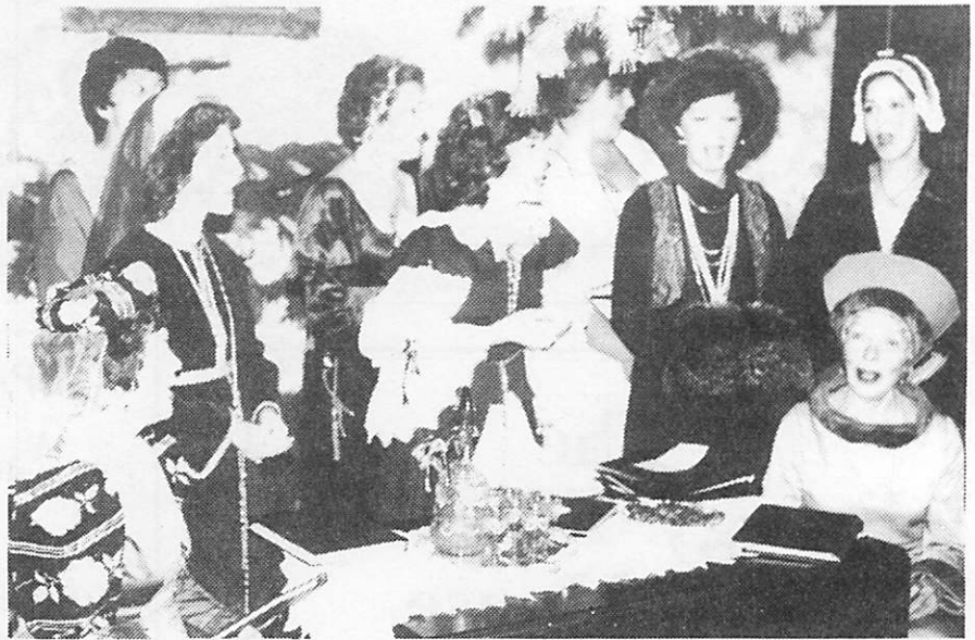
"The Merrie Madrigals" Sing at Victorian Open House

Sales in the Potpourri Shoppe were brisk during all of the Christmas activities. Our supply of goods for sale was enhanced by the furnishing of