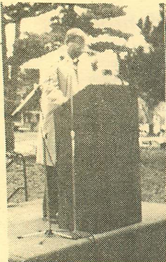
Former Governor Hon. John B. Swainson, Member of Michigan Historical Commission gives the address.