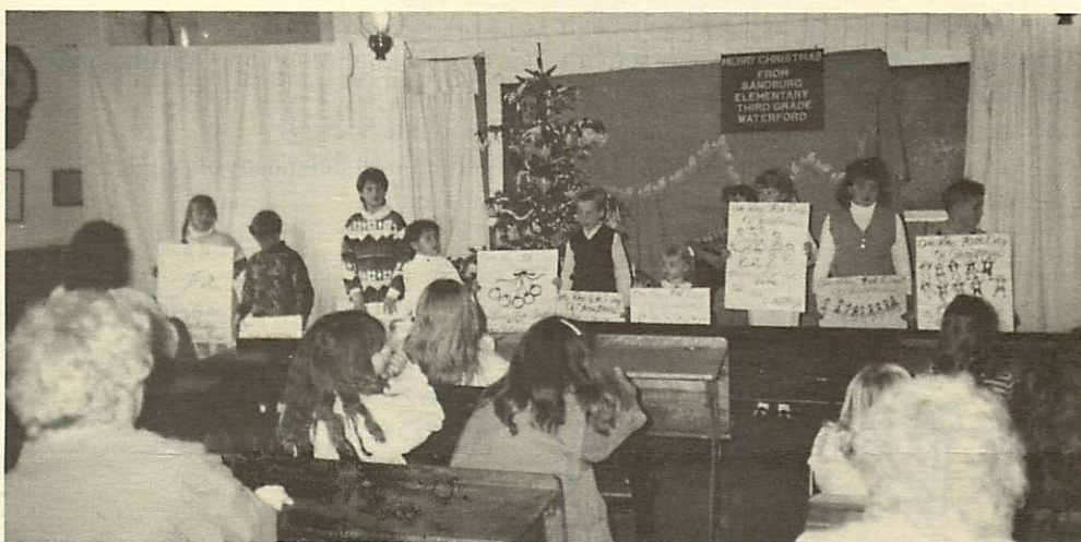
Sandburg Elementary School of Waterford presents a special Christmas program in the Pine Grove Schoolhouse.