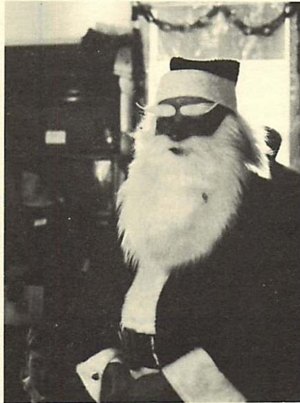
Santa at the Schoolhouse