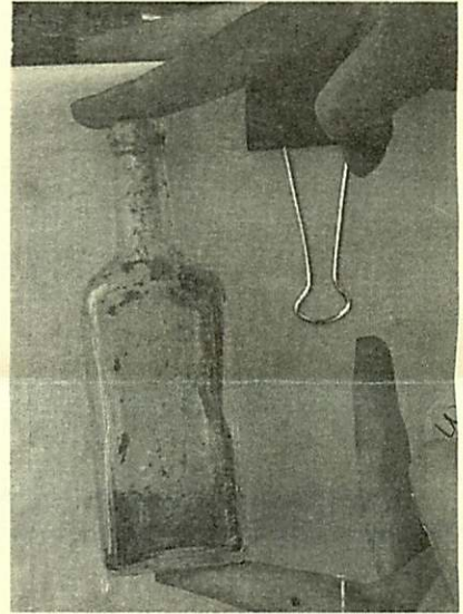
From the Ice House Dig