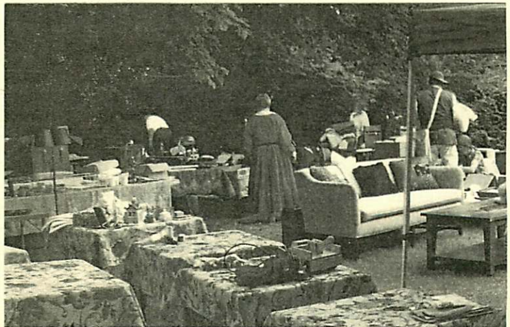
White Elephant Sale