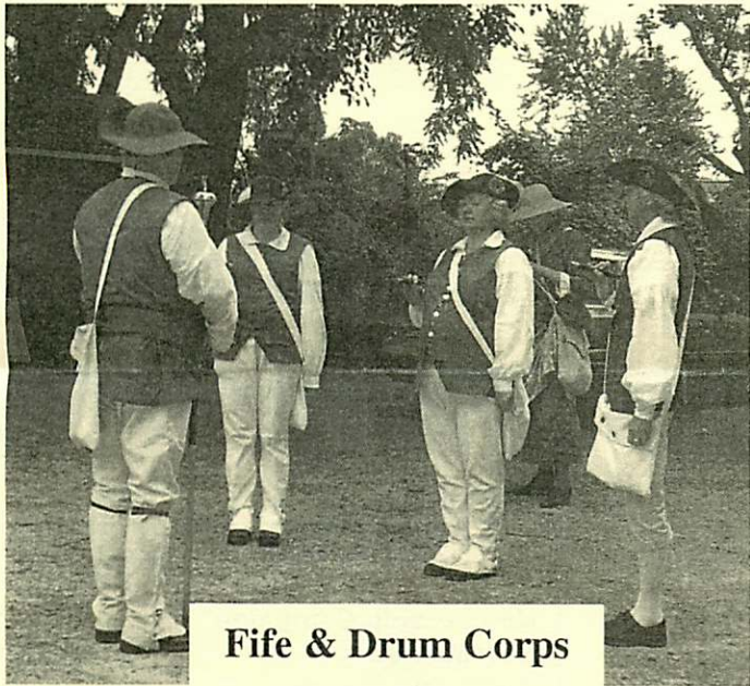
Fife & Drum Corps