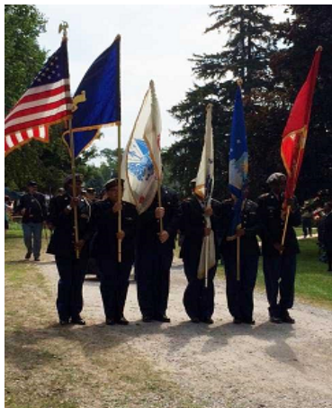
The Pontiac High School JROTC assisted with the opening ceremony.