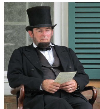
President Lincoln returned as one of the featured speakers.

I heard many comments afterward from attendees who enjoyed themselves very much. As successful as this event was, we will work to ensure that our next Summer Social is even bigger and better. See you on July 30, 2016!