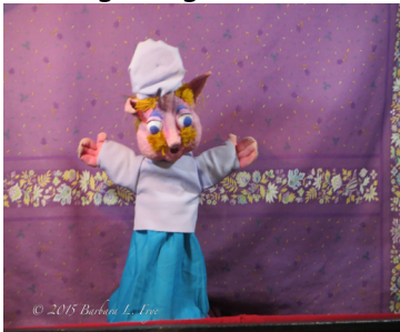
(One of the delightful characters of Pippin Puppets.)