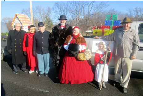
OCPHS was represented in Pontiac's Holiday Extravaganza Parade!