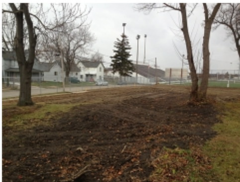
After: New fencing, improved visibility and a better relationship with our neighbors!