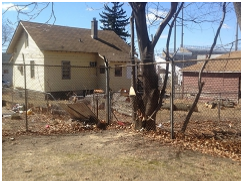
Before: The properties behind Pine Grove were an eyesore and major safety concern.