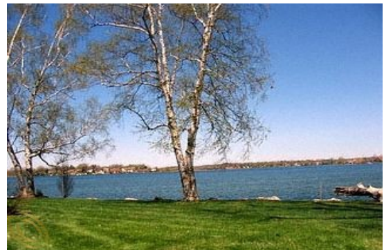
Sylvan Lake today

Following the exploratory expedition, the land was surveyed and put up for sale. The price was $2 per acre, but if you paid cash, the price dropped to $1.25 per acre. As Colonel Stephen Mack's settlement of Pontiac grew and prospered, settlers spread out and the Sylvan Lake area was slowly developed. The next major boom came in the early 1900's. The Detroit United Railway ran a trolley line from Detroit to Pontiac, which passed by Sylvan Lake. The Tower Park amusement park and the Happy Home Picnic Park were founded; both became popular destinations for Detroit residents. They could pack a picnic lunch and spend the day swimming, fishing and boating on beautiful Sylvan Lake.