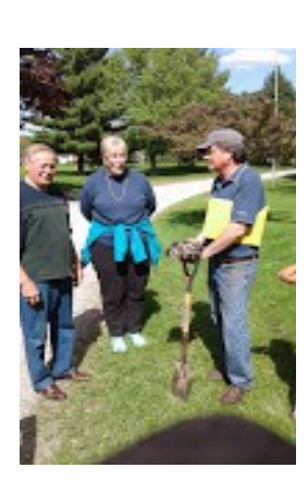
Welcome sunny days at Pine Grove! Volunteers with green thumbs are working their magic!