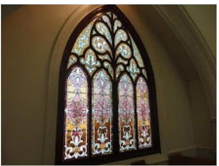
An example of the stained glass throughout the chapel