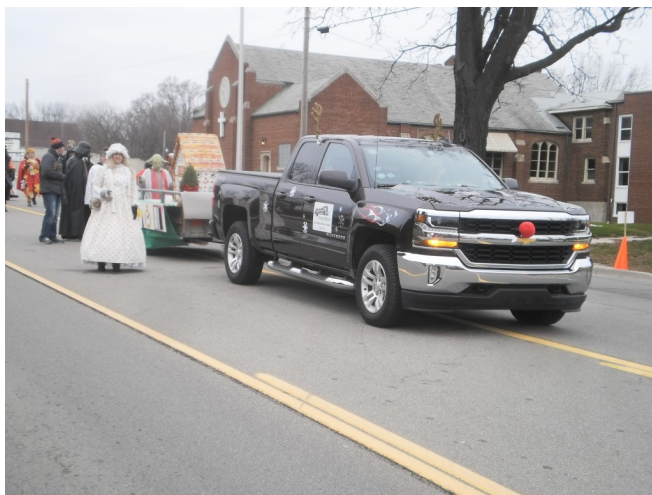
There goes the OCPHS gang down Cesar Chavez Avenue at the Holiday Extravaganza parade!

Many Thanks to our visitors, volunteers, and sponsors!