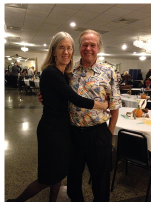
The auctioneer and his beautiful wife.