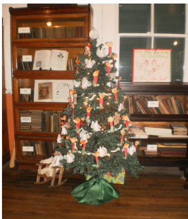
The Drayton Plains One-Room Schoolhouse welcomed families visiting Santa with its charming and festive décor.