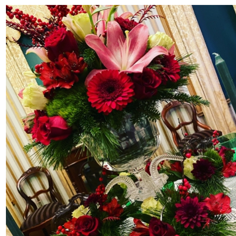
A beautiful floral display, crafted by The Henk Studio of Pontiac, graced the Dining Room during the VOH.