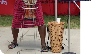
Baba O Story teller

June 14, 2023 ~ Oakland County Court House June 17, 2023 ~ Bagley Street & Downtown Pontiac