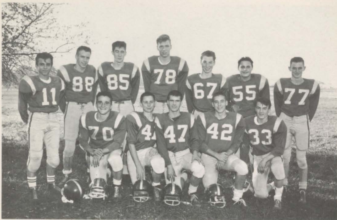
Sophomore Football Players Freshmen Football Players