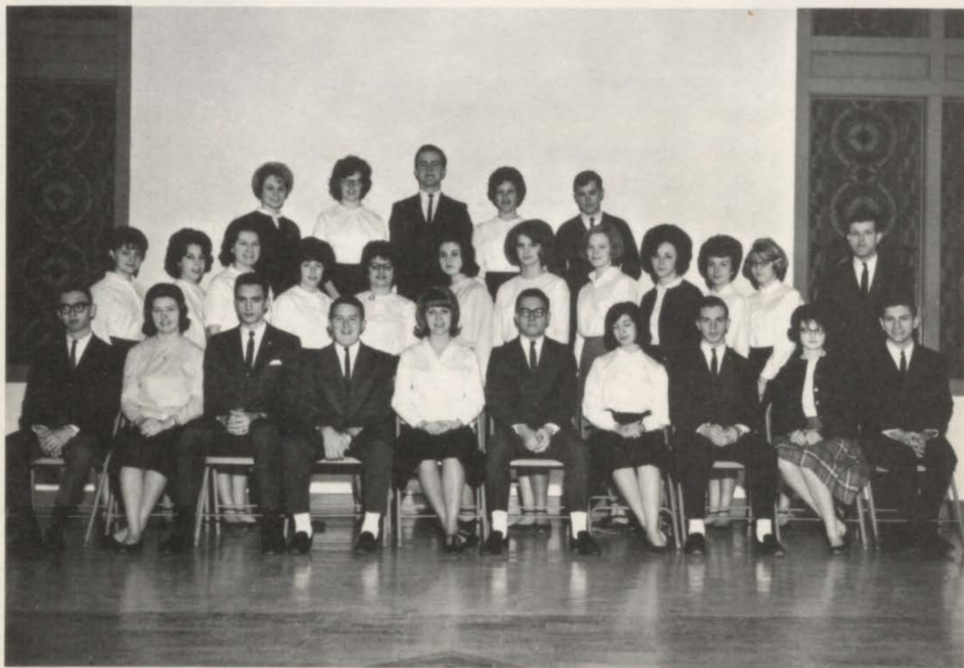
National Honor Society