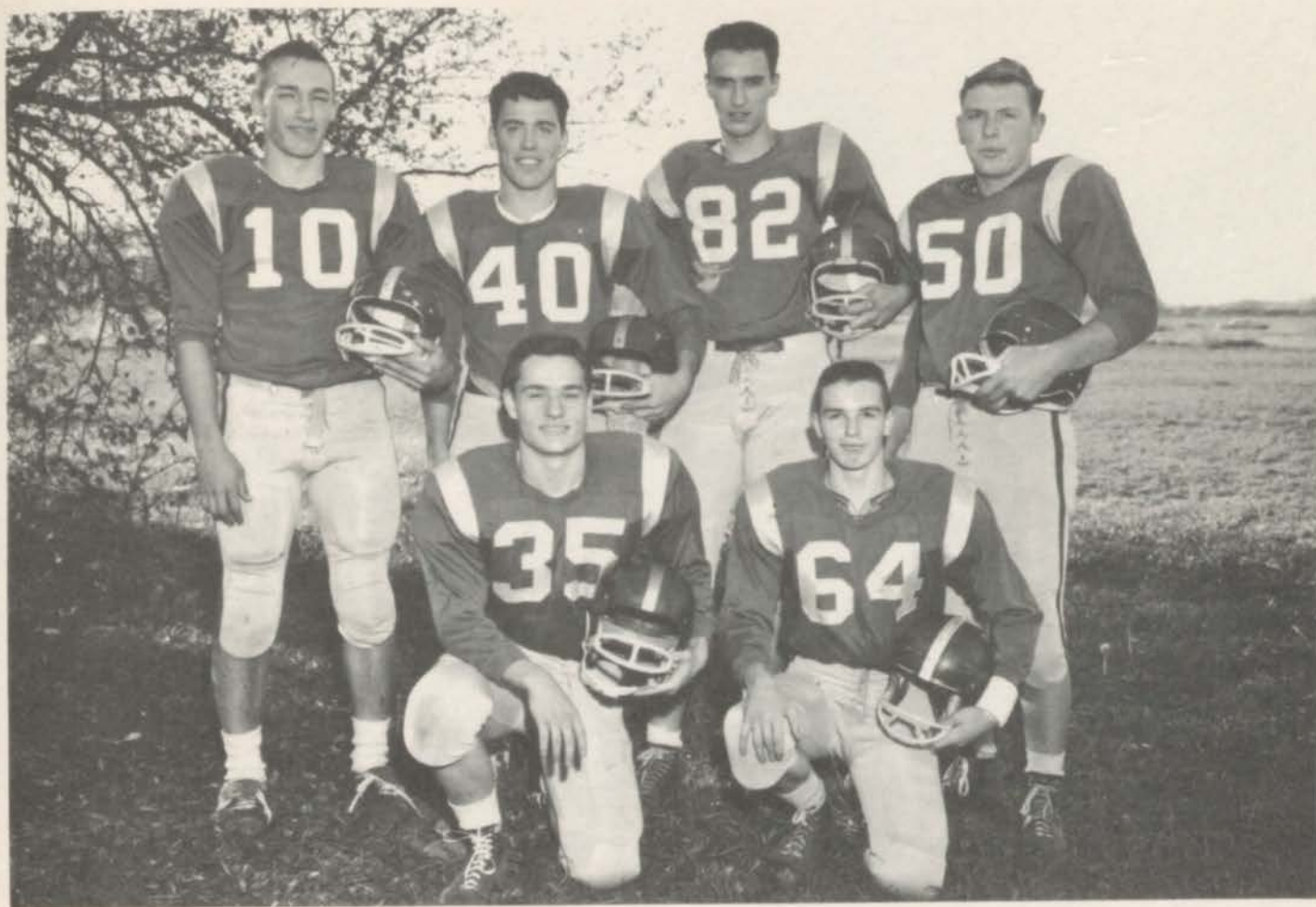
Senior Football Players