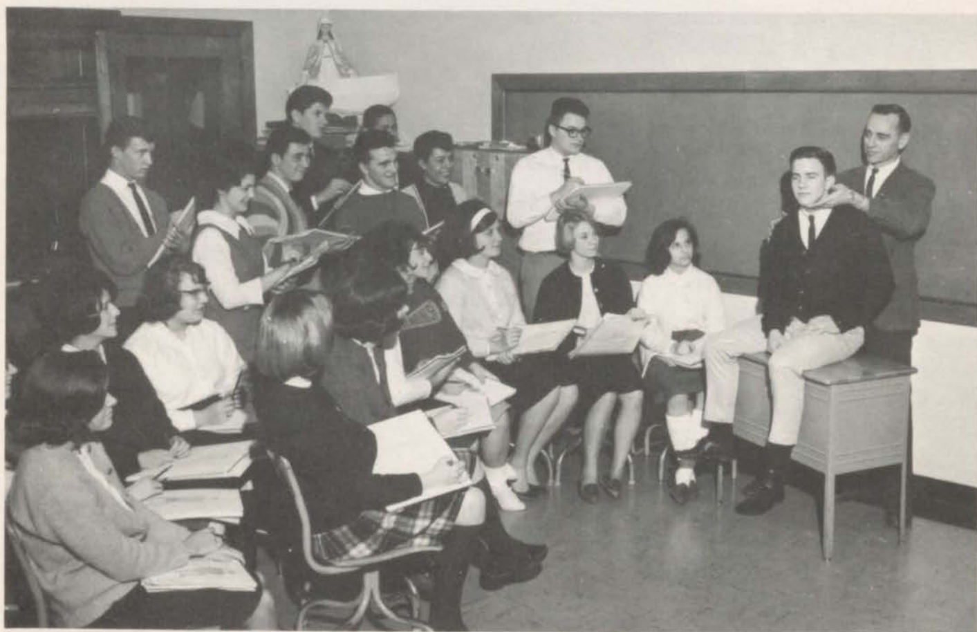
Where model students become student models.