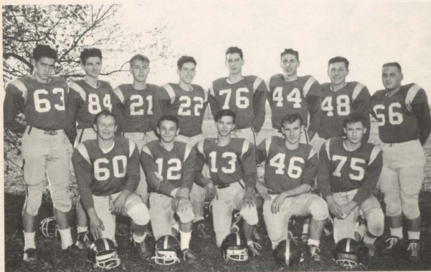
Junior Football Players