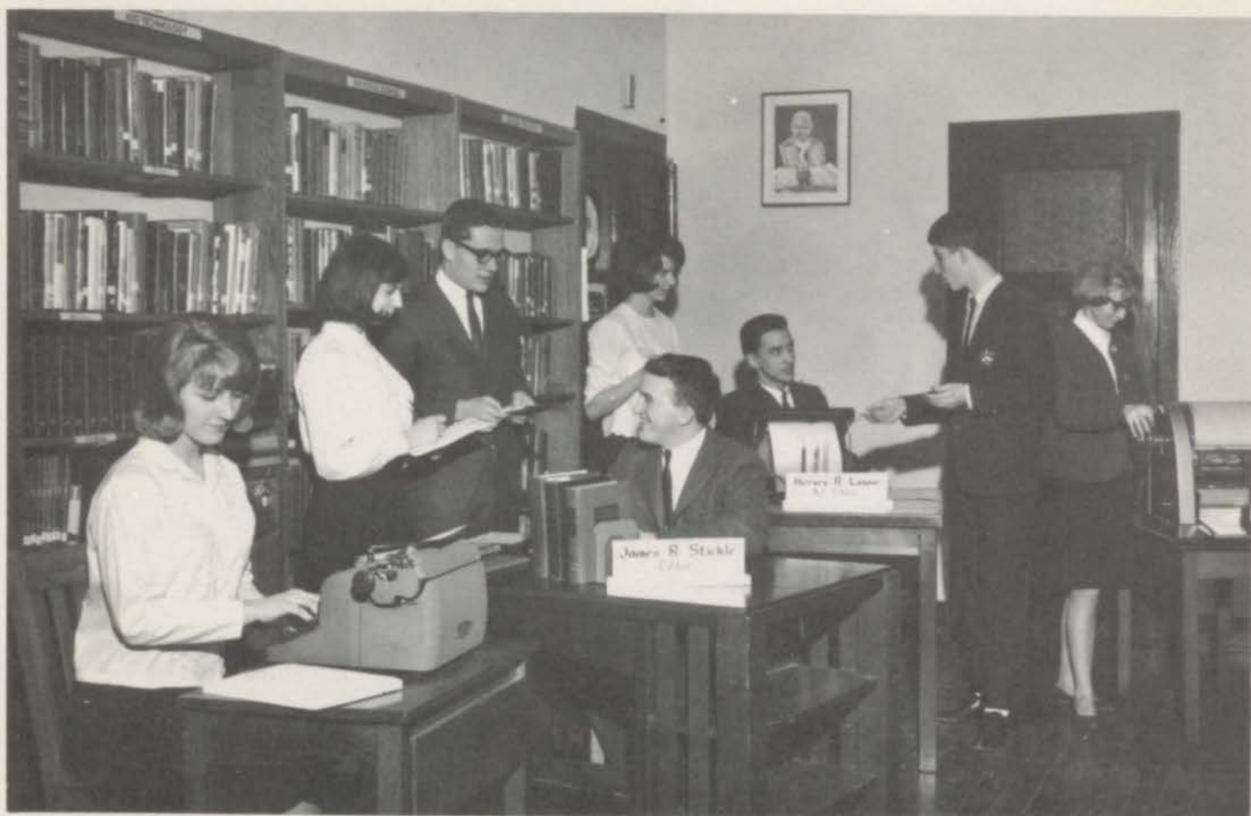
Michaelite - News-from Us to You