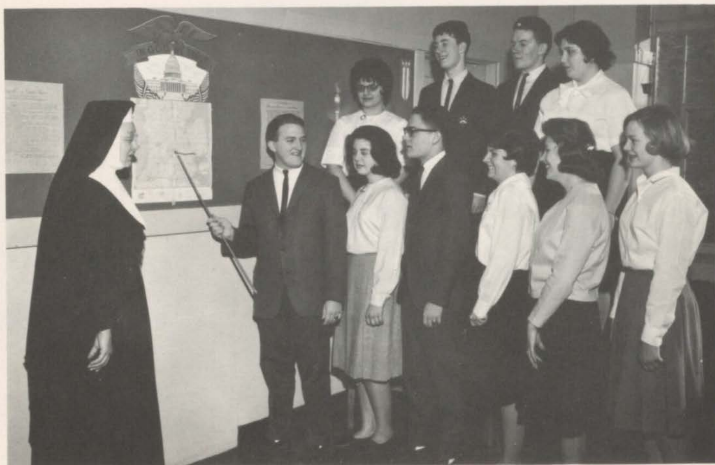
D.I.S.G.A. - All roads lead to the capital.