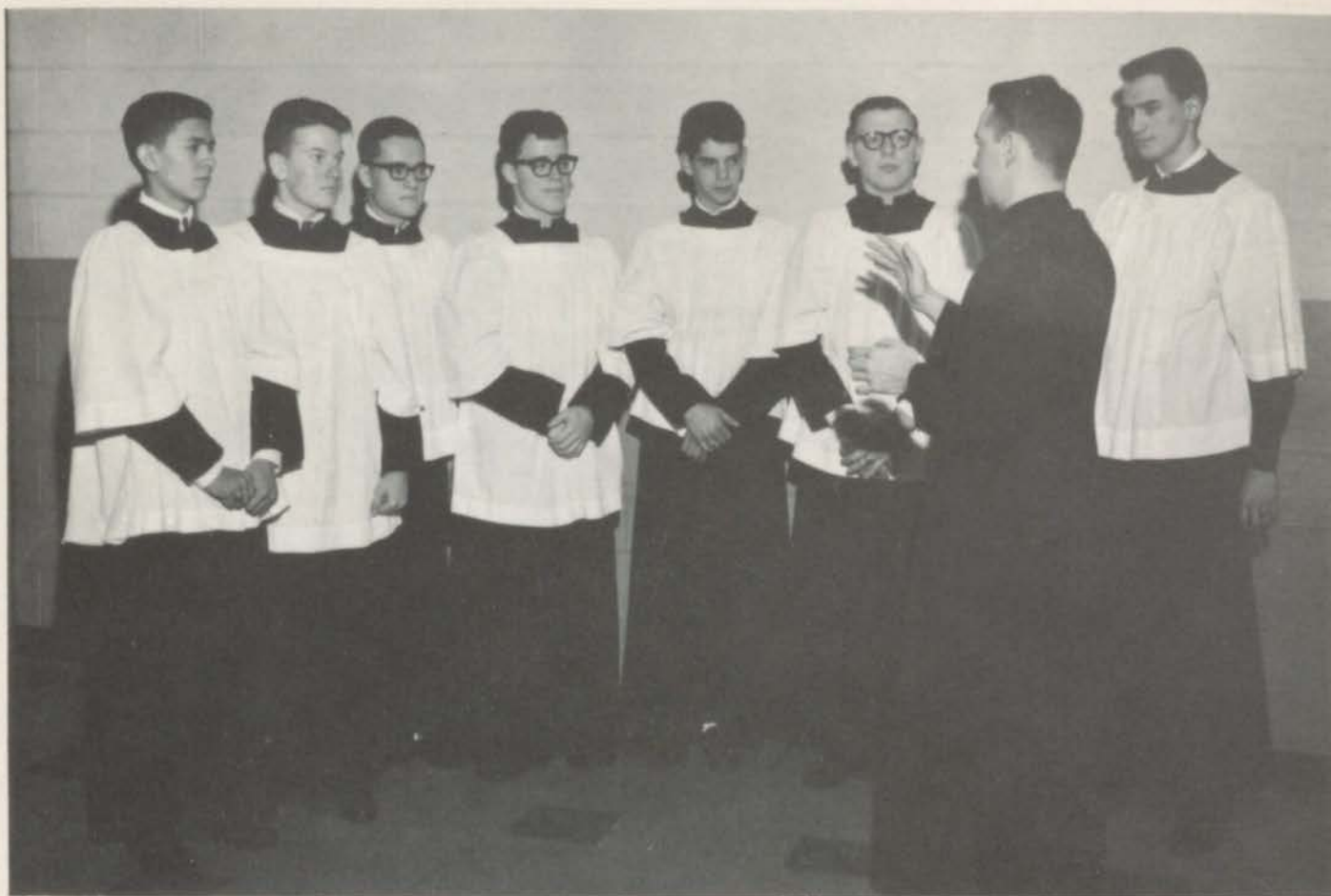
Altar Boys - Vanguards of Christ