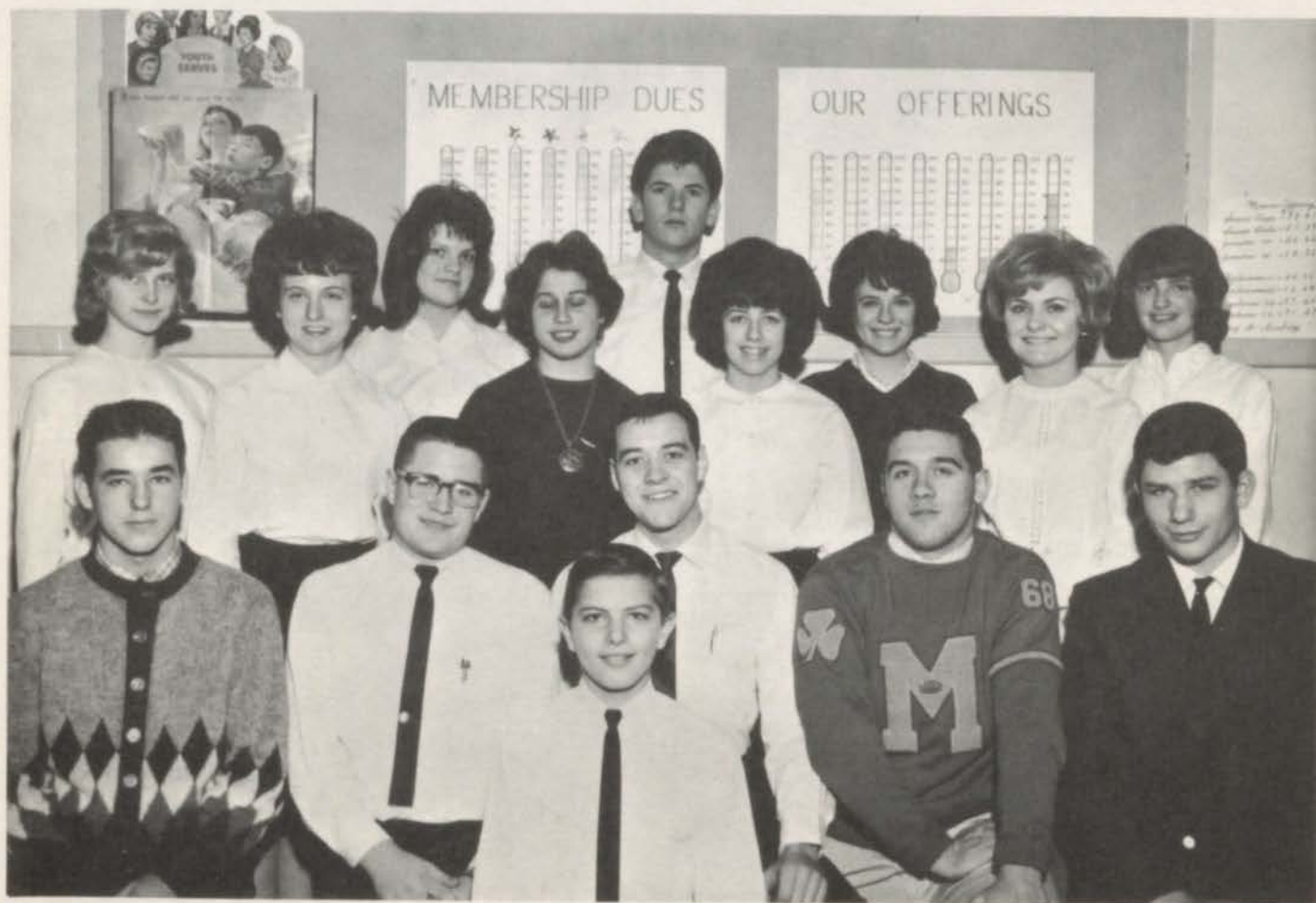
Mission-minded students help their friends in the fields afar.