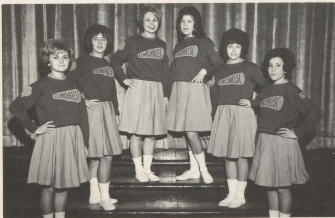
Junior Varsity Cheerleaders