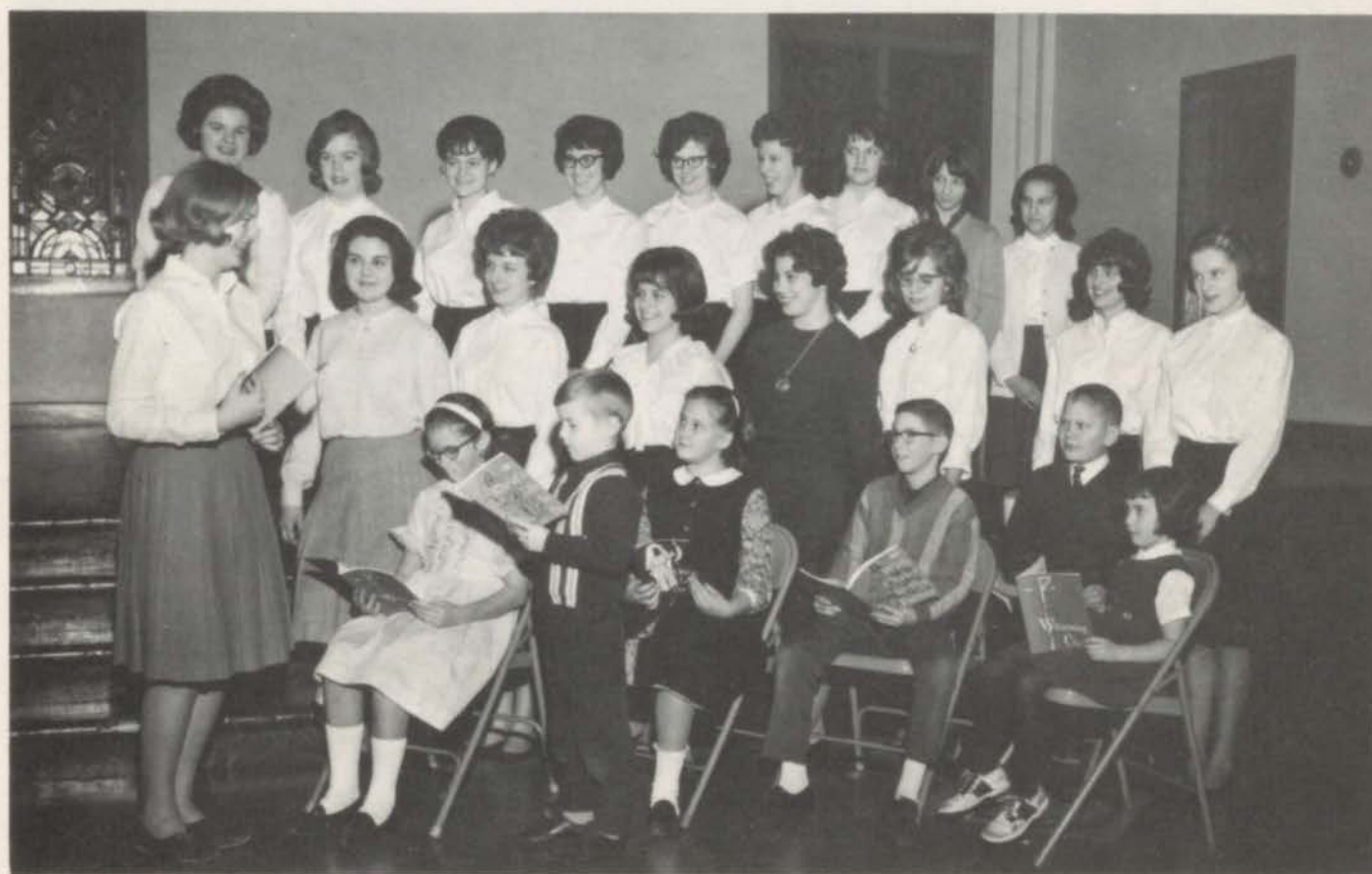
C.C.D. Teaching them to know Him, to love Him, and to serve Him.