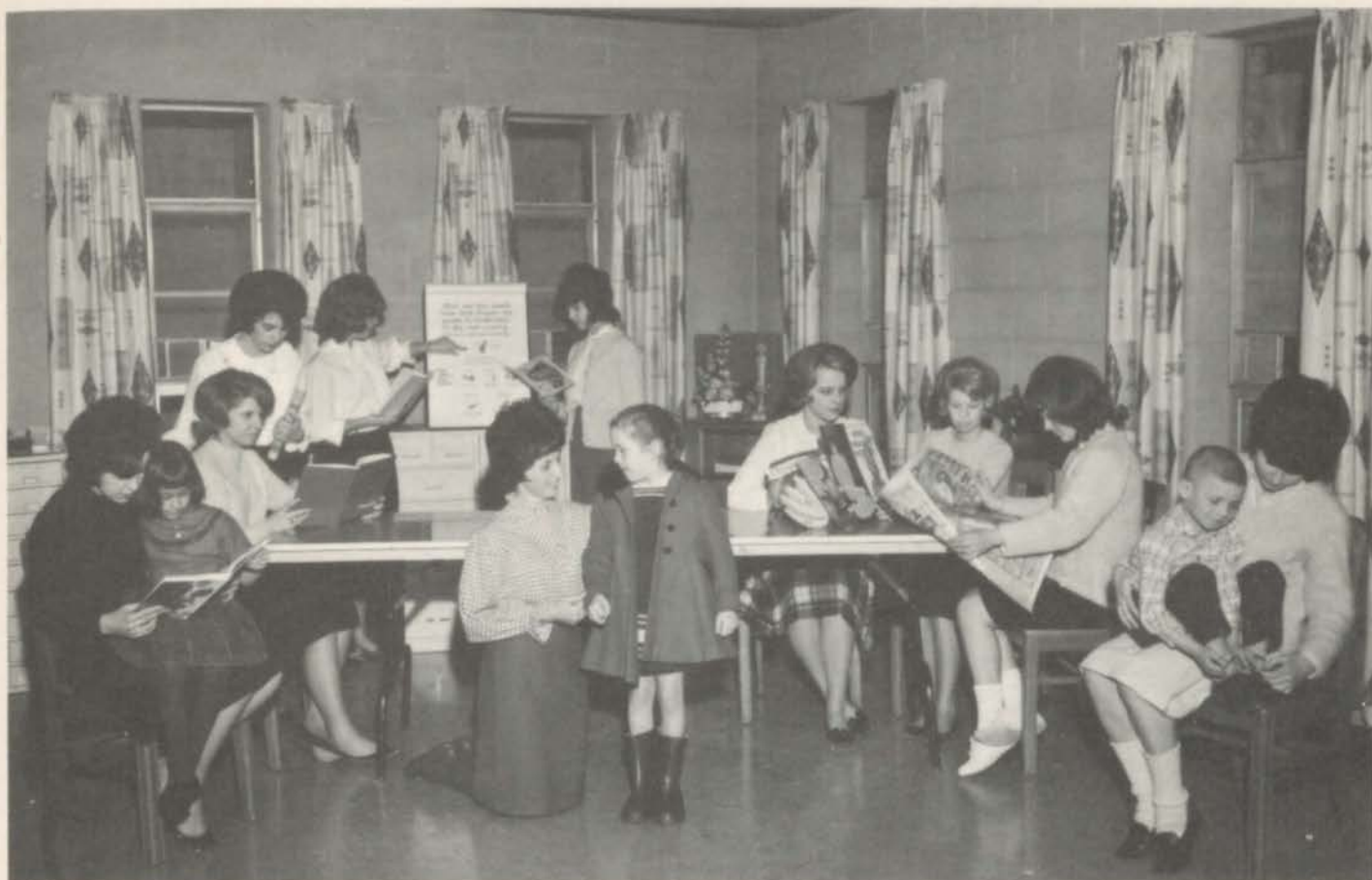
Future Homemakers of America