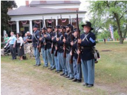
(Reenactors stand at attention during the opening ceremony.)

It was a very dry summer. Unfortunately, Mother Nature chose that day (July 30 th ) to rain on our parade. In spite of that adversity, we had a successful ice cream social. Even though our attendance was down due to the weather, we cleared $4,000, which matched last year's profit. This was due to an increase in sponsorships and gift shop sales and a decrease in our expenses.