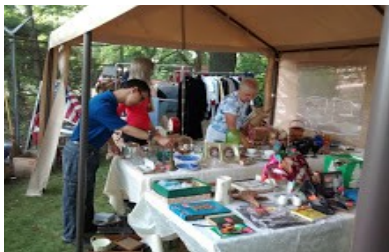
(Guests peruse the unique offerings at the Curiosities Sale.)